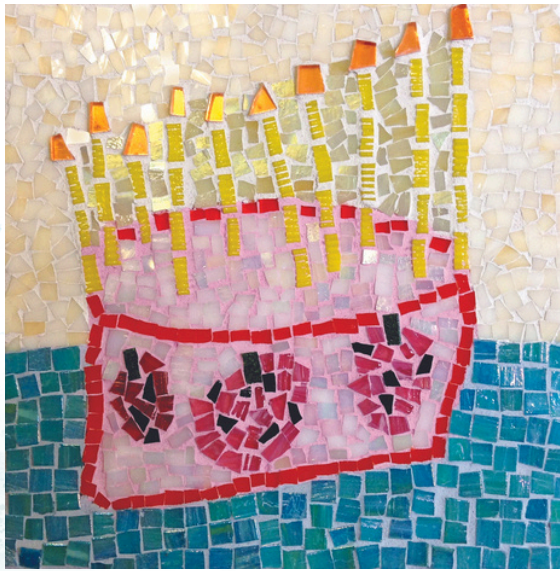
Birthday Cake