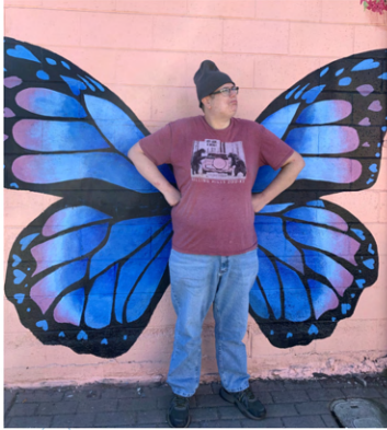
President Lincoln