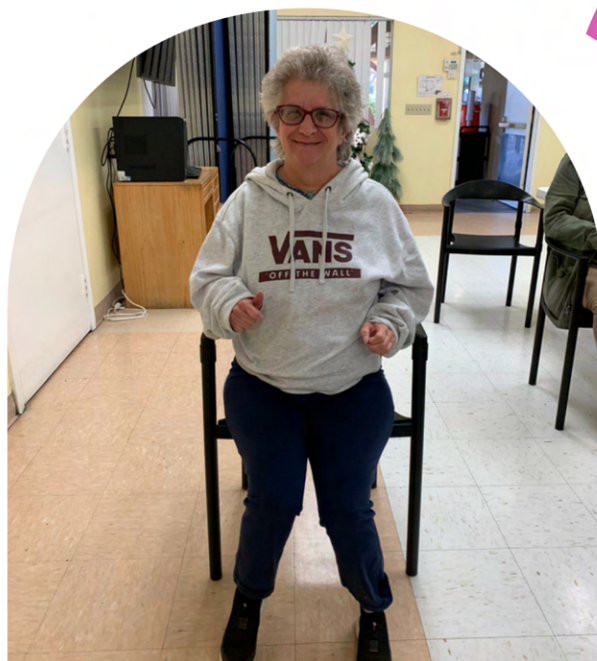
MOSAIC ANGEL