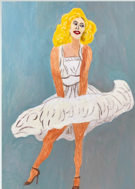
Marilyn Monroe