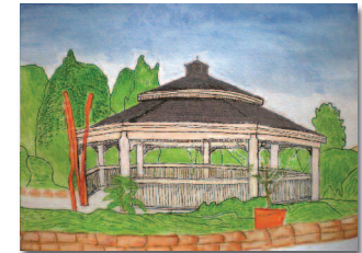
Art by SMSC Student Tim Conaway

The newest addition to the SMSC campus is the Hinman Plaza and Pavilion dedicated in Loving Memory to Laura Rose Geraghty Hinman. The pavilion serves as a lovely spot in the SMSC garden that can host events for up to 60 people. It is a choice location open to the public for weddings, memorials and charity events. It also serves as the location for SMSC programs such as music therapy, gardening and self-advocacy board meetings.