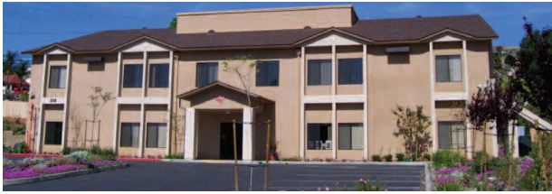
SMSC New Multi-purpose Building

St. Madeleine Sophie's Center, located in El Cajon, California on a five-acre campus, provides educational and vocational programs for more than 400 developmentally disabled adults. SMSC is committed to enabling adults with developmental disabilities to discover, experience, and realize their full potential as members of the greater community through innovative, individualized programs.